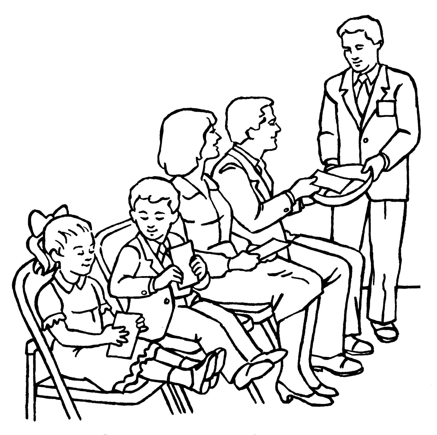
Pentecost pictures God's people as the "firstfruits" of those He is calling into His Family.

Parents: Explain to your child that he or she will help teach God's way of life — the way of "give" — in the World Tomorrow.