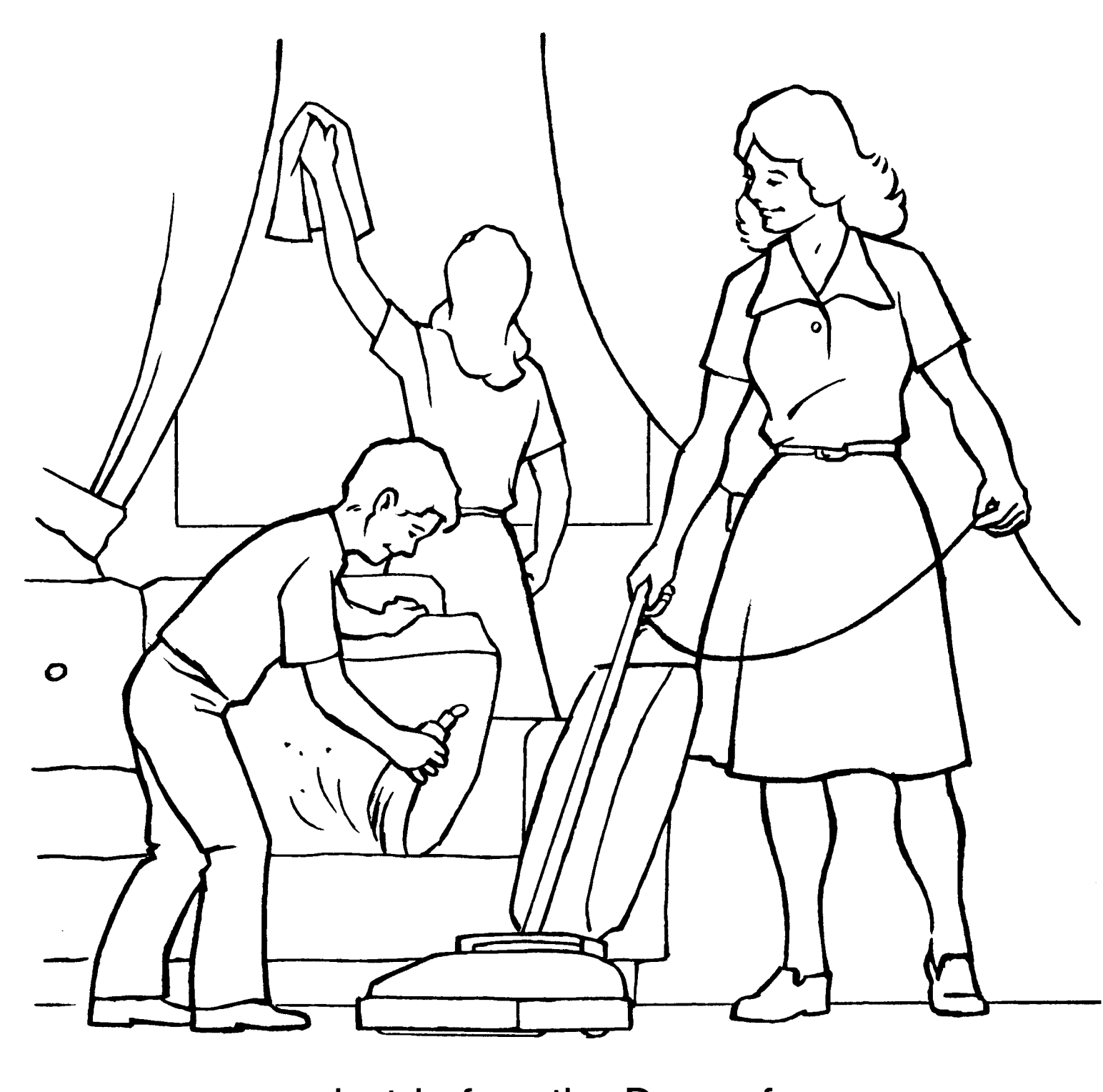
Just before the Days of Unleavened Bread, we must put all the leavening out of our homes.

Parents: Ask your child what leavening has to do with bread. Then explain the relationship between leavening and sin, and why it is so important not to sin.