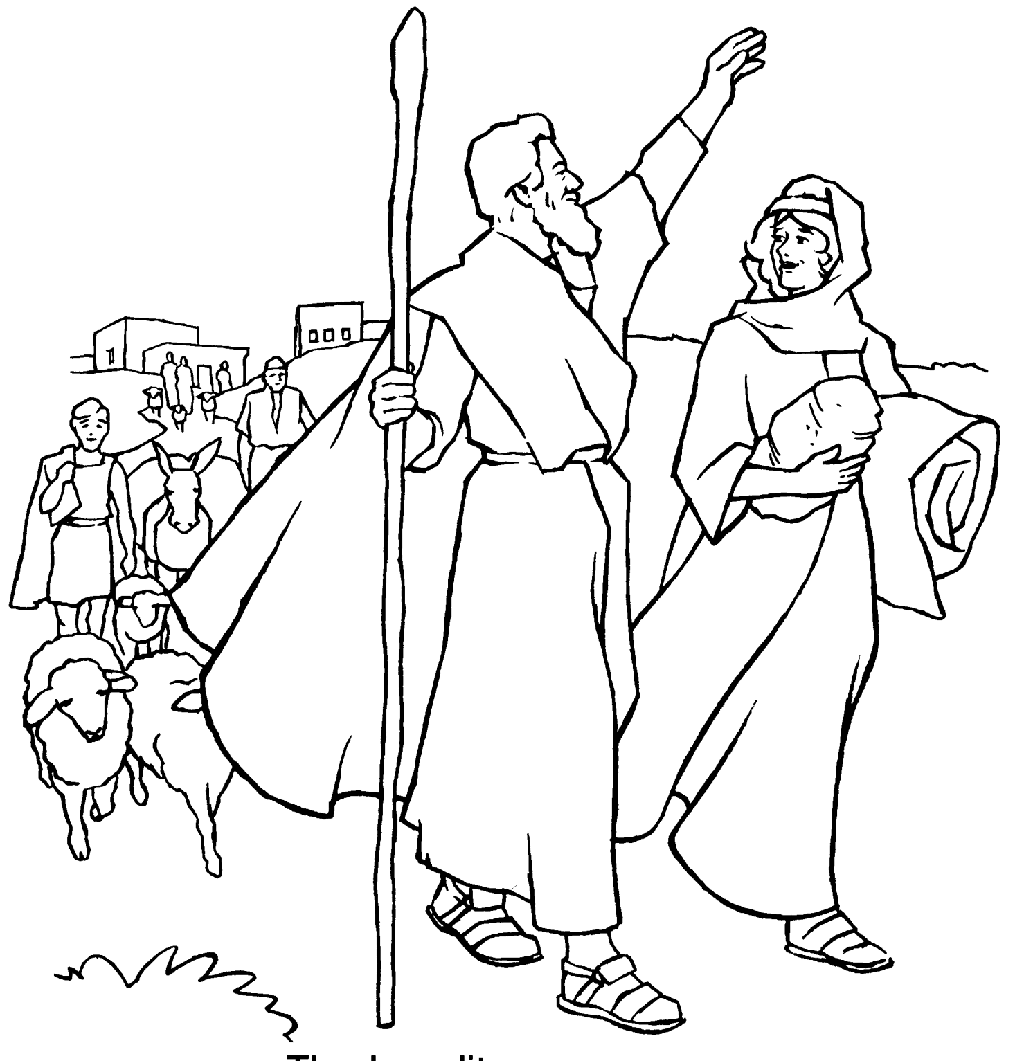
The Israelites were very happy that God delivered them from slavery in Egypt!

Parents: Ask your child this question: What did the Israelites celebrate on the night they left Egypt, that God's people celebrate today?