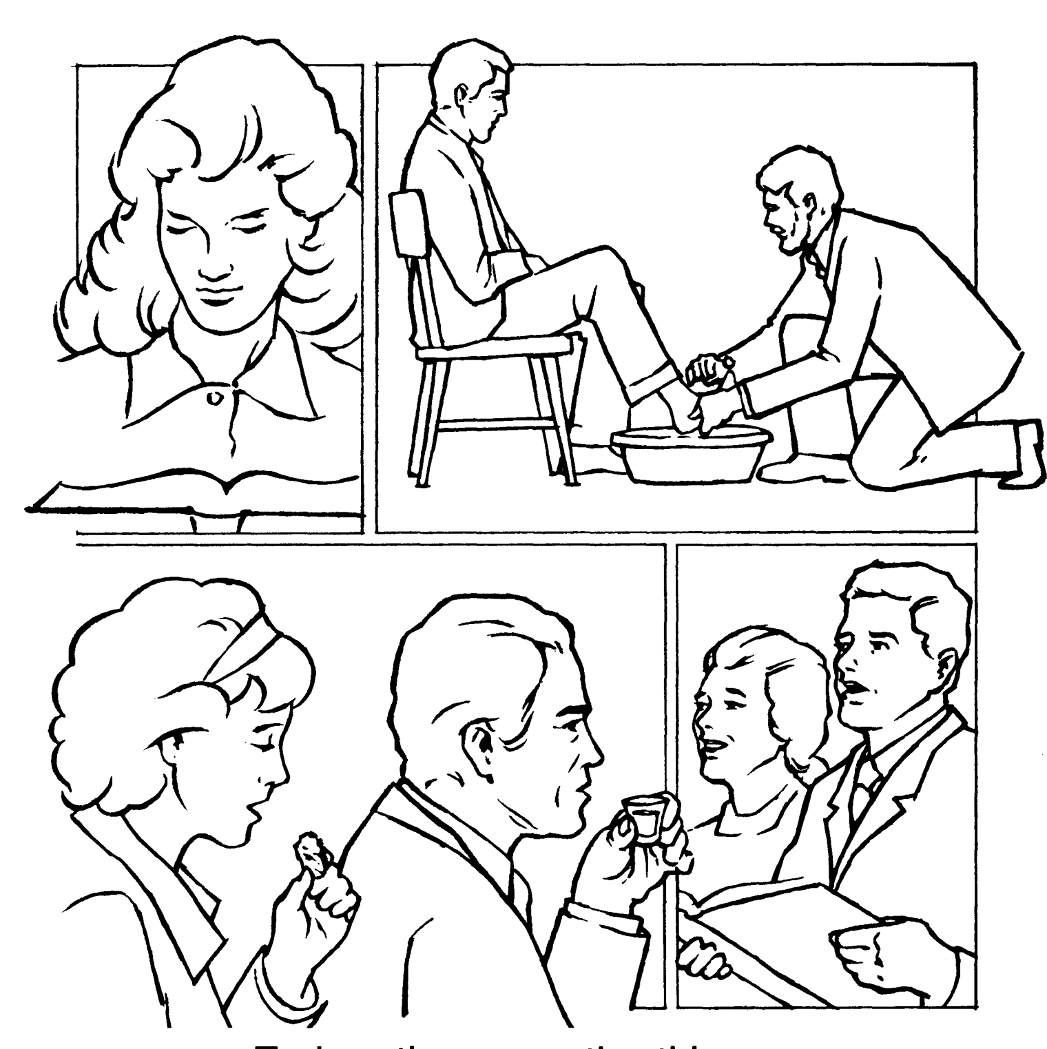
Today, these are the things God's people do on Passover night to remember Christ's death.

Parents: Instruct your child to color the pictures. Also, review the meaning of Passover, and the meaning of each of the pictures.